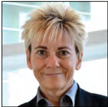
FROM OUR CHAIR

Pg1 InspireCIO celebrates 20 years of CIO success.